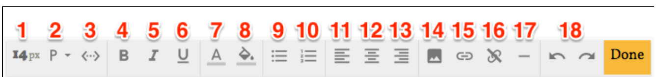
Text formatting toolbar

Formatting toolbar buttons (from left to right)